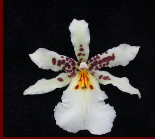
Eastern Maine Orchid Society