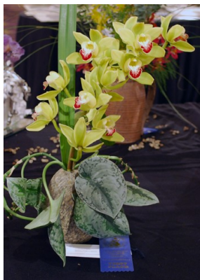
Prize winning arrangement

Someone tried to buy it off my display three times! I put all the small pleuros I bought on display in my booth, which added a nice touch. I got compliments on how I displayed them in wine glasses.